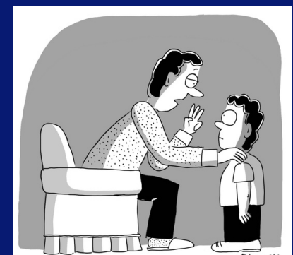
“SON, THERE ARE THREE THINGS I WANT YOU TO NEVER FORGET... NEVER GIVE UP ON A DREAM... MARRY FOR LOVE... AND USE 8-DIGIT COMPLEX PASSWORDS!”