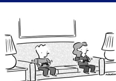
"It's interesting - Mom hates early Christmas sales, but she loves early back-to-school sales."